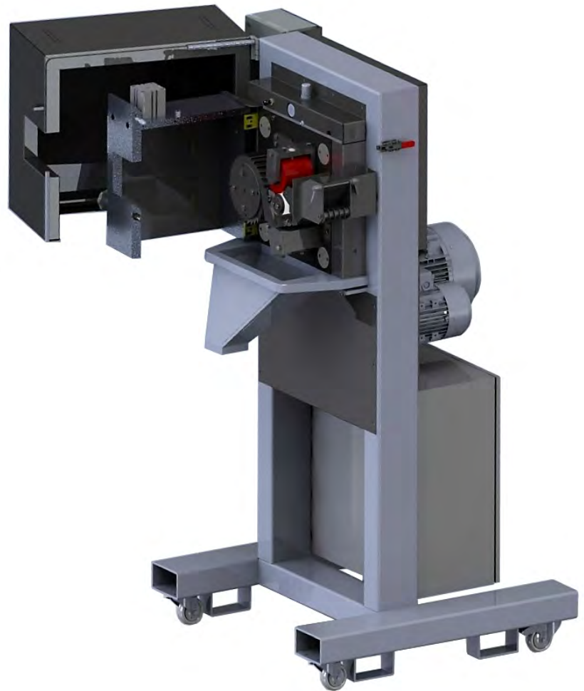
Pelletizer PT-G100E - duodrive